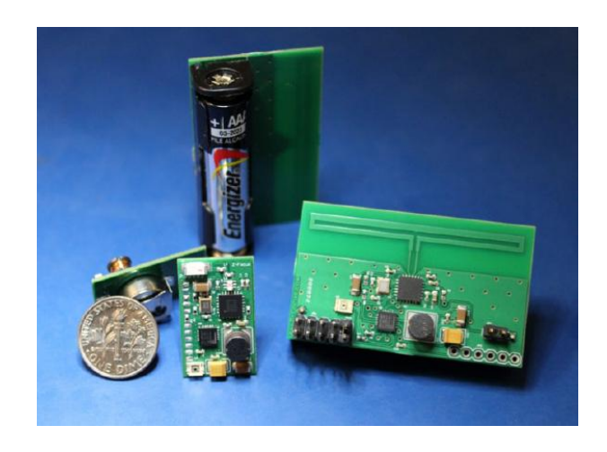
Figure 1: TINY and LOWCOST emBeacons

A TINY emBeacon design (schematic, layout, bill-of-materials, and firmware) is provided for applications limited size constraints, and a LOWCOST emBeacon design is provided for lowest cost applications not limited by size.