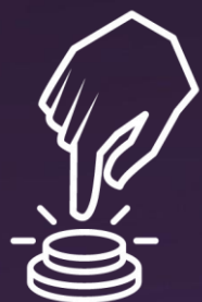
Soft Cap Button